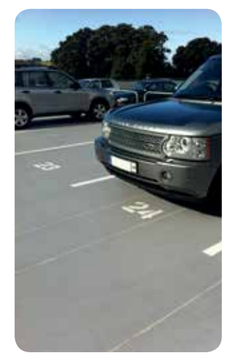
Roof Level Car Park Deck Systems