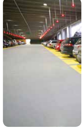
Basement Level Car Park Deck Systems