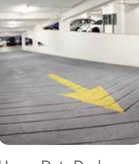
Heavy Duty Deck Systems for Ramps

This guide has been produced to give an overview of floor specification considerations when selecting suitable moisture-proofing and resin deck coating systems on lowest basement, intermediate and roof level decks of parking structures.